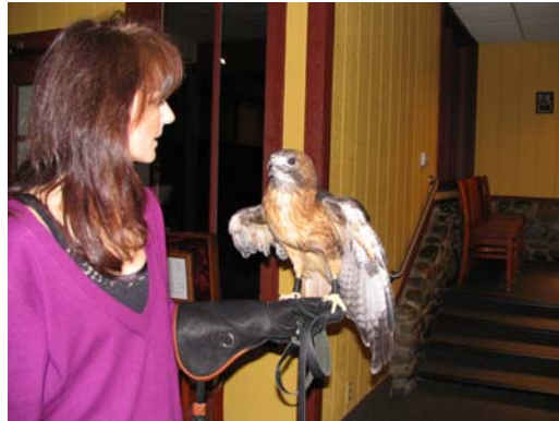
Kelly, Red-Tailed Hawk

Gold Country Wildlife Rescue is a non-profit organization dedicated to the rescue and rehabilitation of injured and orphaned wildlife. Their trained volunteer rehabilitators are licensed by California Department of Fish & Game to care for and release native wildlife. Each year, their group provides care for hundreds of birds and mammals. They do not get financial assistance from state or federal agencies. They depend on memberships, donations, and fundraisers to continue.