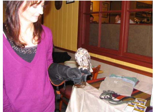
Otis, Screech Owl